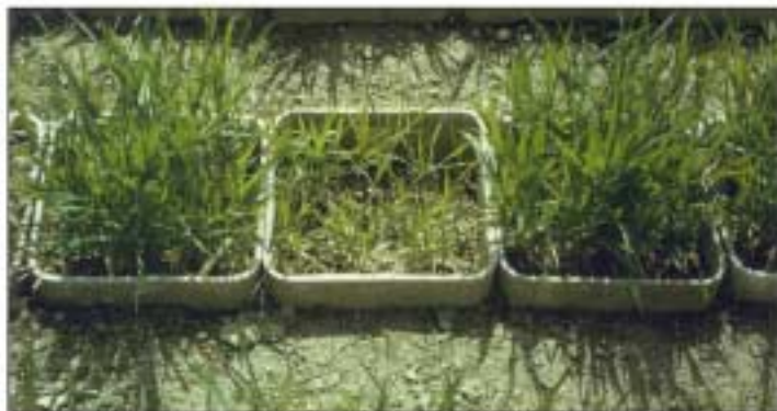
Figure 4. Stunted hard wheat plants in a microplot heavily infested by M. artiellia (center), compared to healthy plants in a noninfested control plot (right) and in a plot slightly infested with the nematode (left).