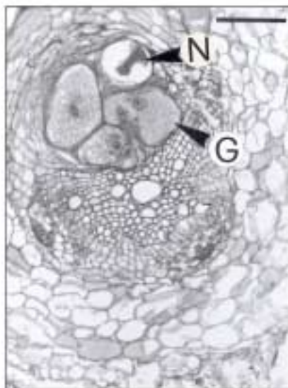
Figure 2. Cross section of a chickpea root infected by M. artiellia . Scale bars=70 \mu m. Note the specialized giant cells (G) which provide nutrients to the nematode (N).

HOST RANGE: Meloidogyne artiellia infects and damages cereals such as barley ( Hordeum vulgare ), sorghum ( Sorghum vulgare ), and wheat ( Triticum durum and T. vulgare ); crucifer crops such as cabbage ( Brassica oleracea ), cauliflower ( B. oleracea var. Botrytis ), radish ( Raphanus sativus ), rashed ( Nasturtium fontanum ) and turnip ( Brassica rapa ); and leguminous crops such as alfalfa ( Medicago sativa ), broad bean ( Vicia faba ), chickpea ( Cicer arietinum ) clovers ( Trifolium incarnatum and T. repens ), dogtooth pea ( Lathyrus sativus ), and vetch ( Vicia sativa ) (1).