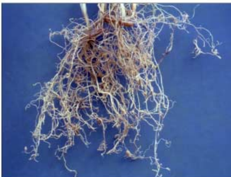
Figure 5. Hard wheat roots infected by M. artiellia . Note the small galls (arrows) and root proliferation induced by the nematode infection.

SURVEY AND DETECTION: The outdoor climatic conditions of Florida are conducive to the establishment of M. artiellia because optimal soil moisture and temperature (15-25° C/59-77° F) conditions occur during winter months and also in early spring and late fall. Hot summer temperatures above 30° C/86° F are, however, unsuitable for nematode infection and development. In case of accidental, introduction of M. artiellia into Florida the nematode can become a threat to legumes such as clover and vetch, and crucifers such as cabbage, cauliflower, radish and turnip. These crops should be checked during cool months for patches of stunted plants with chlorotic leaves or other