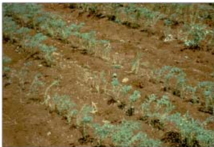
Figure 3. A large patch of stunted plants in a chickpea field heavily infested by M. artiellia in Syria.

GEOGRAPHICAL DISTRIBUTION: Meloidogyne artiellia has been reported in Algeria, France, Greece, Italy, Morocco, Spain, Syria, and Tunisia (9 and records of the Agricultural Nematology Institute, Bari, Italy).